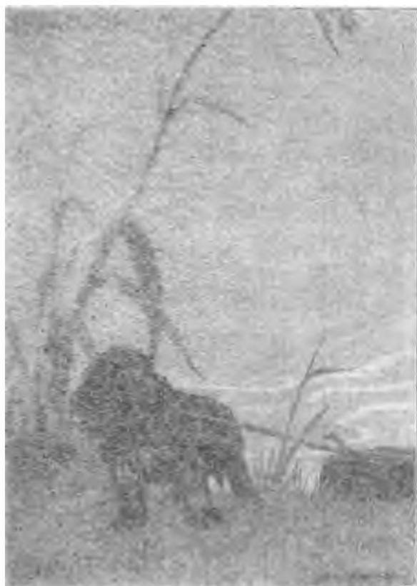
● THEY WERE LUCKY TO HAVE PROVIDED TO BE A SMALL, WET, AND LONG-WAGGING PUPPY